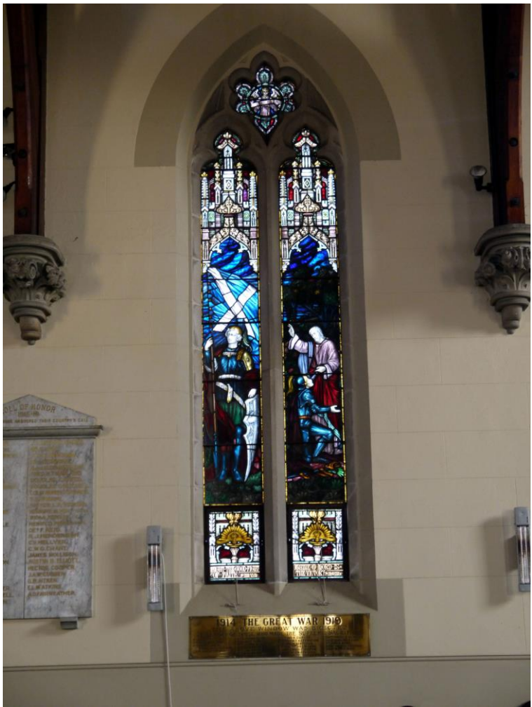
Ashfield Presbyterian Church Great War Memorial Stained Glass Window